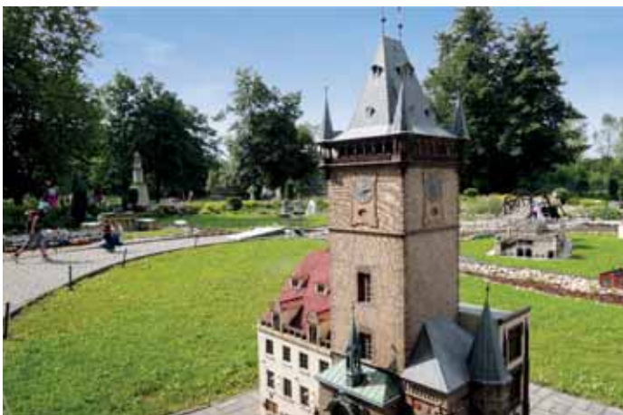
World of Miniatures Miniuni