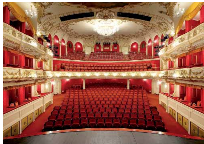
Antonín Dvořák Theatre