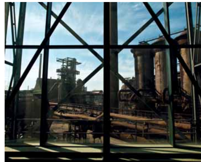
Lower Vítkovice area