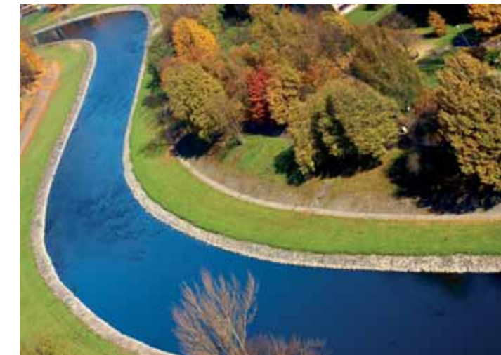
Bank of the Ostravice River