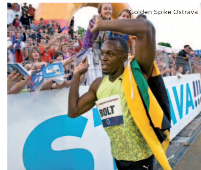
Golden Spike Ostrava

This is a family festival of in-line skating for everyone in Ostrava featuring also professional competitions. The races taking place in the Municipality of Ostrava-Poruba are included not only in the Czech Cup, but also in the World Inline Cup. Grease your wheels! Prepare to start! Three, two... www.lifeinline.cz