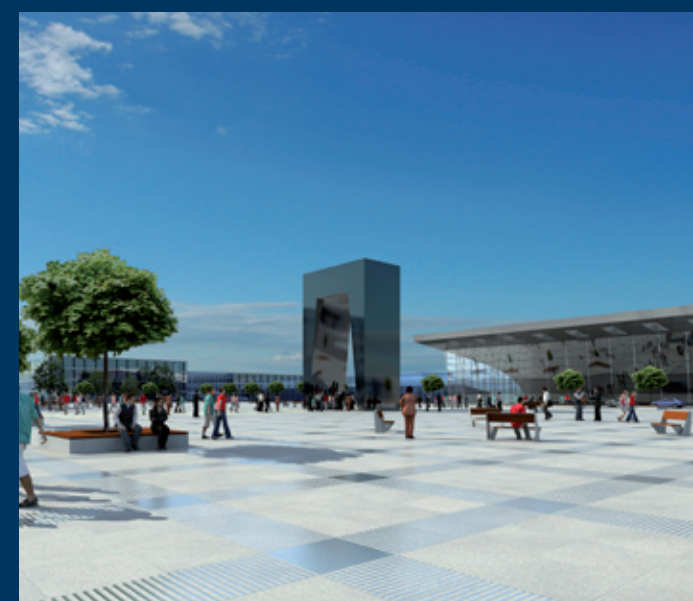
Visualization of the Leoš Janáček Administrative and Shopping Centre