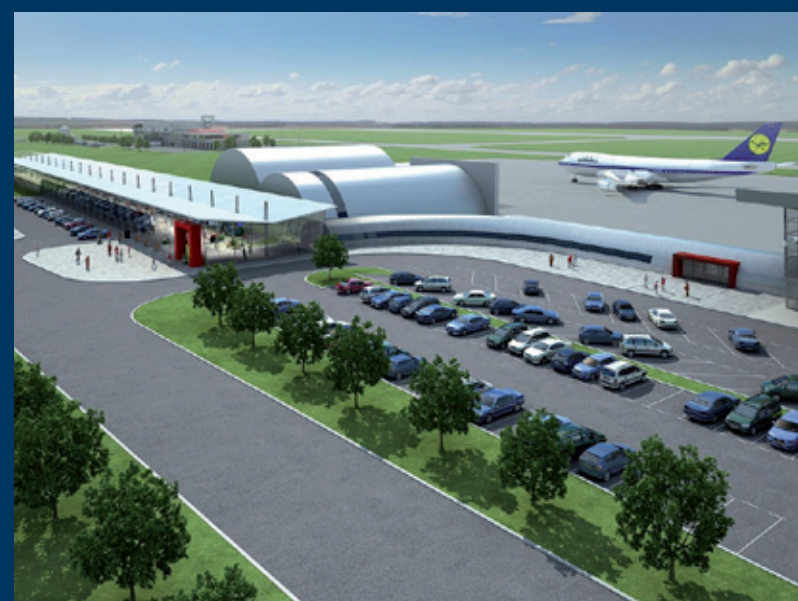
Visualization of Ostrava Airport railway station