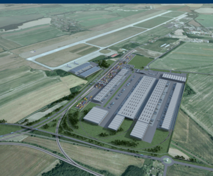
Visualization of the Multimodal Logistics Centre

Just south of the existing Mošnov Strategic Industrial Zone, a new 10 ha site has been prepared for SMEs (small and medium-sized enterprises), whose activities are related to the development of the airport, but which do not meet the criteria for the Mošnov Strategic Industrial Zone.